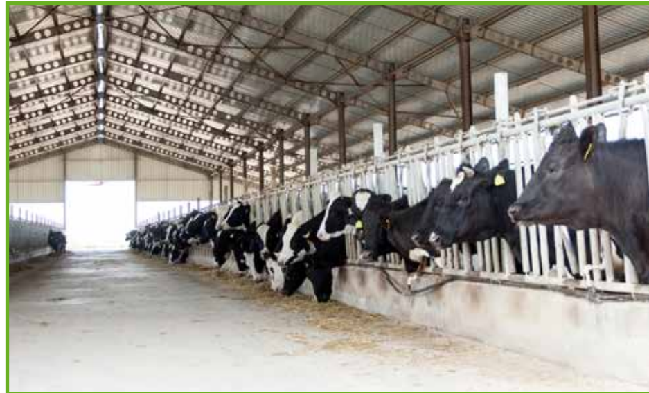
KÖSTER SL Protect for industrial and agricultural areas with high exposure to chemicals and acids