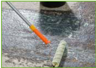
2. Prime with KÖSTER SL Primer