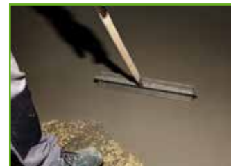
6. Lastly a KÖSTER Spiked Roller is used for de-airing

Self-leveling underlayment for concrete repair in areas with high exposure to chemicals and acids