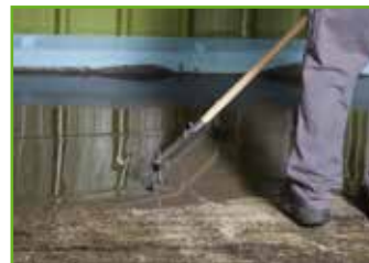
5. While working larger areas use a KÖSTER Gauging Rake to distribute the material