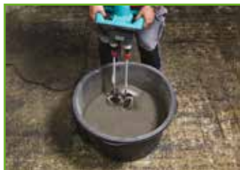
3. Use an electrical paddle mixer and mix intensively for three minutes