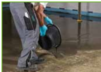
4. Distribute the material in the desired layer thickness directly after mixing