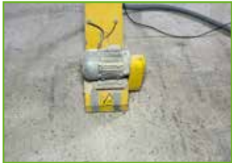
1. Substrate preparation